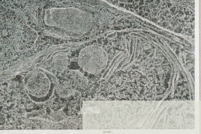
@ 7.0 in